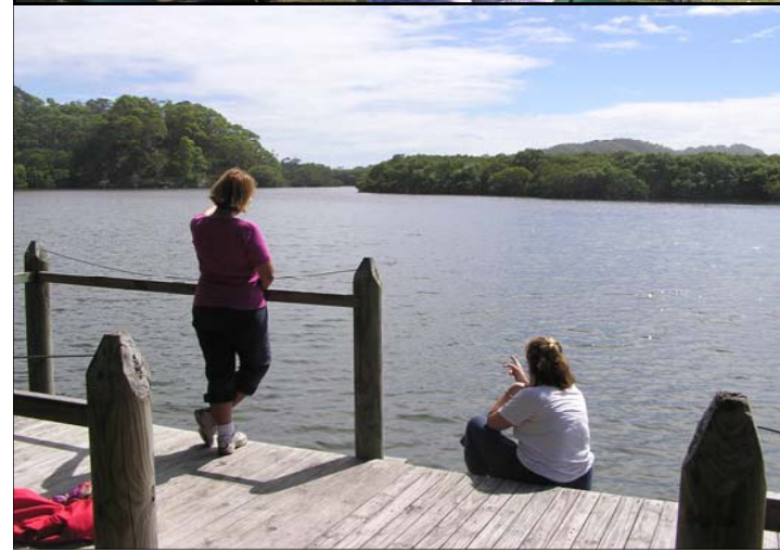
"The Yarrahapinni Experience"